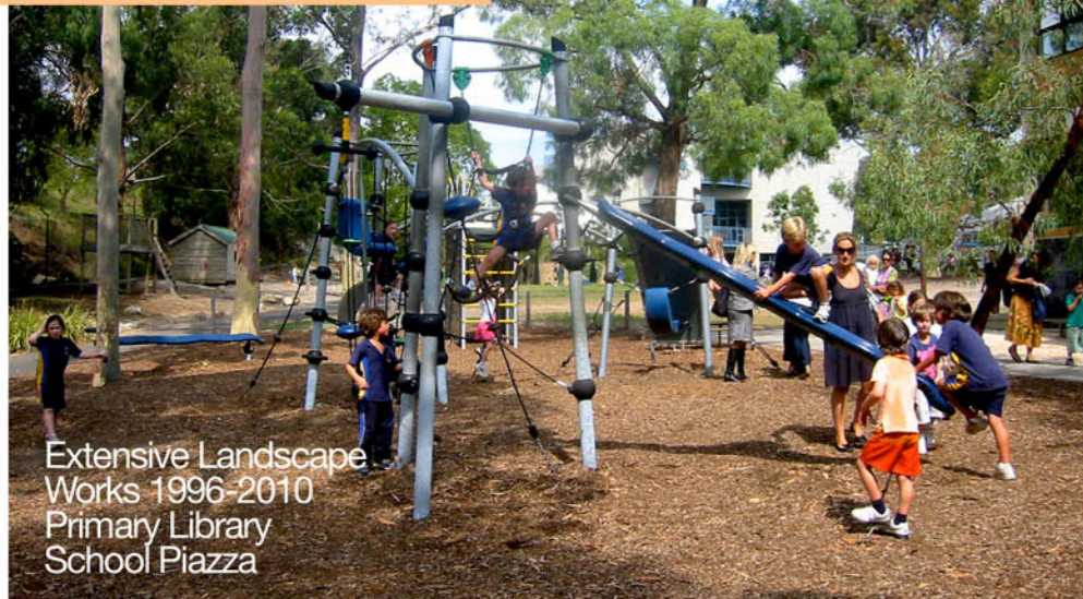
Extensive Landscape Works 1996-2010 Primary Library School Piazza