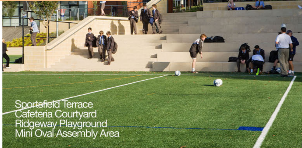
Sportsfield Terrace Cafeteria Courtyard Ridgeway Playground Mini Oval Assembly Area