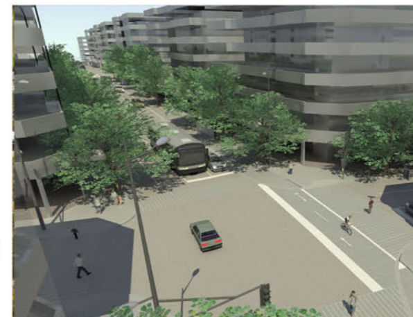
3D impression of proposed medium density living in Dandenong