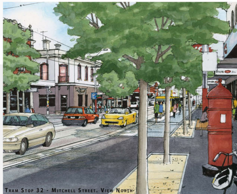
Perspective sketch of High Street, Northcote upgrade