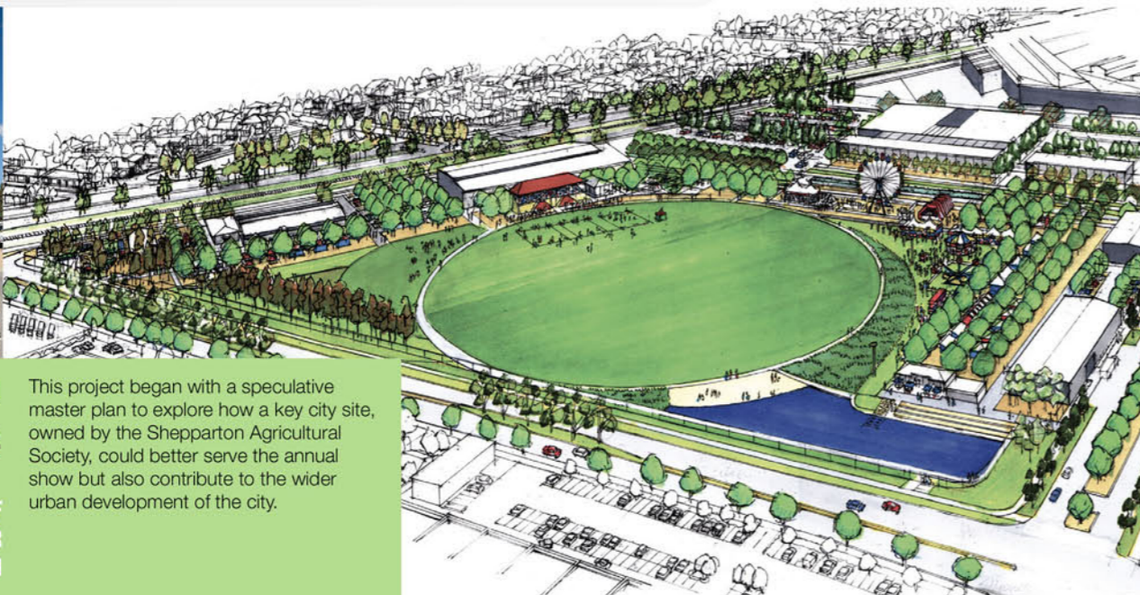
Shepparton Showgrounds master plan perspective sketch