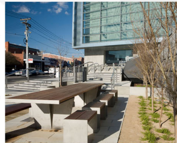
Custom designed furniture