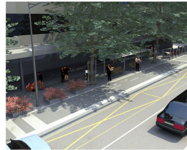
Bus shelter and streetscape